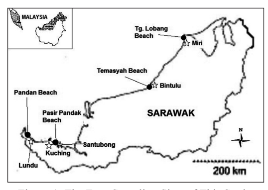
Figure 1: The Four Sampling Sites of This Study

villages take initiatives to conduct beach cleanup at least twice a year in Pandan beach since there is no scheduled rubbish collection. Pasir Pandak, Temasyah and Tg. Lobang beaches have public amenities and are maintained by the local authority appointed contractor for the regular rubbish collection of at least twice a week. This is due to the location of the beaches which is within the urban areas.