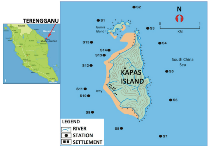
Figure 1: Sampling stations surrounding Kapas Island sediment