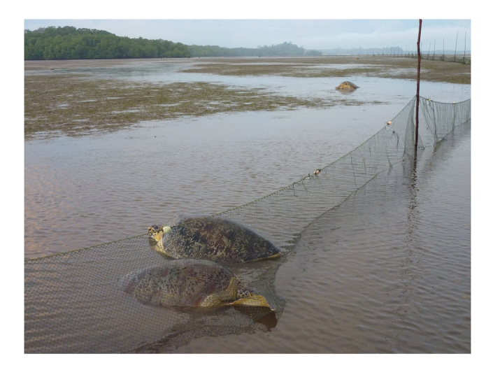
Fig. 2. Traditional fish-catching device known as 'kabat' was used to trap sea turtles at Brunei bay.

have indicated that green turtles often forage in mixed aggregations drawn from various nesting populations (Bass et al., 2006; Dethmers et al., 2010; Nishizawa et al., 2013), whereas some foraging aggregations are mainly contributed by specific populations (Dutton et al., 2008; Prosdocimi et al., 2012; Nishizawa et al., 2013; Naro-Maciel et al., 2014). Juvenile sea turtles reach their foraging grounds by transportation of oceanic current in combination with their own active swimming (Putman and Mansfield, 2015), and sea turtles in foraging grounds will return to nest at their natal regions known as natal homing, which forms genetic differences among rookeries (Allard et al., 1994; Bowen, 1995). Therefore, knowledge on the connectivity between green turtles in nesting and foraging grounds can be used to quantify the impact of threats. In addition, the size class of green turtles inJapan (Hayashi and Nishizawa, 2015). In fact, almost all turtles captured in Mantanani Island, Malaysia, are juveniles (Pilcher, 2010; Jensen et al., in press-a); hence, the composition of size classes is important to formulate a comprehensive management plan and policies for sea turtles in Southeast Asia.