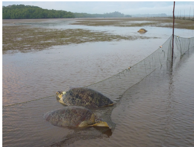
Fig. 2. Traditional fish-catching device known as 'kabat' was used to trap sea turtles at Brunei bay.

have indicated that green turtles often forage in mixed aggregations drawn from various nesting populations (Bass et al., 2006; Dethmers et al., 2010; Nishizawa et al., 2013), whereas some foraging aggregations are mainly contributed by specific populations (Dutton et al., 2008; Prosdocimi et al., 2012; Nishizawa et al., 2013; Naro-Maciel et al., 2014). Juvenile sea turtles reach their foraging grounds by transportation of oceanic current in combination with their own active swimming (Putman and Mansfield, 2015), and sea turtles in foraging grounds will return to nest at their natal regions known as natal homing, which forms genetic differences among rookeries (Allard et al., 1994; Bowen, 1995). Therefore, knowledge on the connectivity between green turtles in nesting and foraging grounds can be used to quantify the impact of threats. In addition, the size class of green turtles inhabiting Brunei Bay remains unclear. Possible ontogenetic changes in foraging grounds have been explored based on green turtles in Japan (Hayashi and Nishizawa, 2015). In fact, almost all turtles captured in Mantanani Island, Malaysia, are juveniles (Pilcher, 2010; Jensen et al., in press-a); hence, the composition of size classes is important to formulate a comprehensive management plan and policies for sea turtles in Southeast Asia.